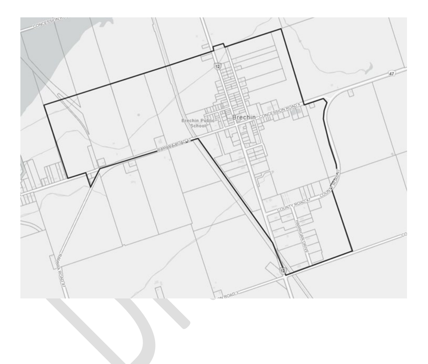
Schedule "B-1" to Bylaw 2024-XX Brechin/ Lagoon City Water Service Area