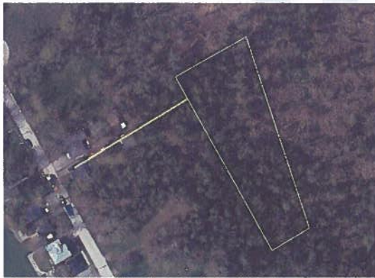
Photo Date: 2023. NOT A PLAN OF SURVEY. Boundary may not line up with aerial photo.