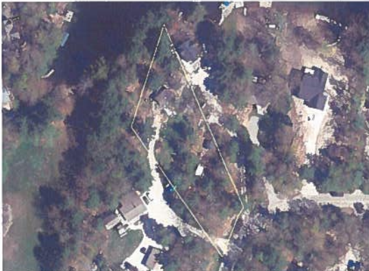
Photo Date: 2023. NOT A PLAN OF SURVEY. Boundary may not line up with aerial photo.