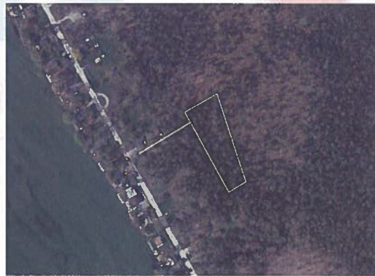
Photo Date: 2023. NOT A PLAN OF SURVEY. Boundary may not line up with aerial photo.

Maps and photos are provided as a courtesy only and the municipality makes no warranties as to the accuracy of this information. Boundaries on aerial photos may be skewed.