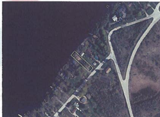
Photo Date: 2023. NOT A PLAN OF SURVEY. Boundary may not line up with aerial photo.

Maps and photos are provided as a courtesy only and the municipality makes no warranties as to the accuracy of this information. Boundaries on aerial photos may be skewed.