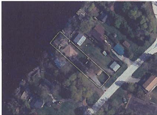
Photo Date: 2023. NOT A PLAN OF SURVEY. Boundary may not line up with aerial photo.