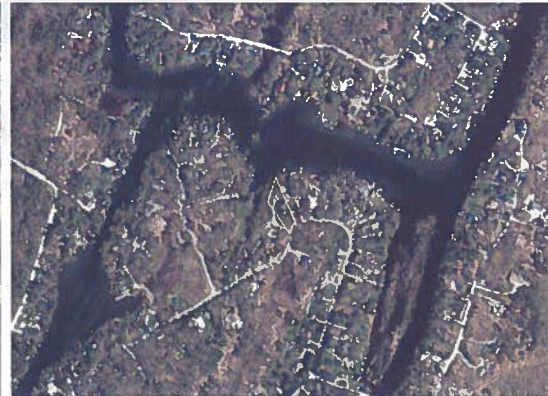
Photo Date: 2023. NOT A PLAN OF SURVEY. Boundary may not line up with aerial photo.

Maps and photos are provided as a courtesy only and the municipality makes no warranties as to the accuracy of this information. Boundaries on aerial photos may be skewed.