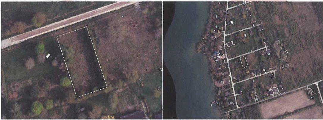
Photo Date: 2023. NOT A PLAN OF SURVEY. Image © First Base Software Inc. © Teramet 2026. Boundary may not line up with aerial photo. Photo Date: 2023. NOT A PLAN OF SURVEY. Image © First Base Software Inc. © Teramet 2026. Boundary may not line up with aerial photo.

Maps and photos are provided as a courtesy only and the municipality makes no warranties as to the accuracy of this information. Boundaries on aerial photos may be skewed.